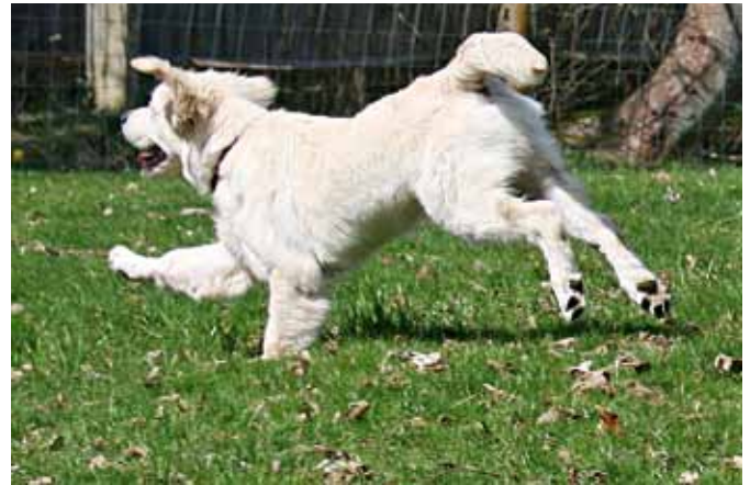
This 4 month old puppy has all of his weight going through his shoulder, elbow and front leg.

Hip and elbow dysplasia can now be tested for